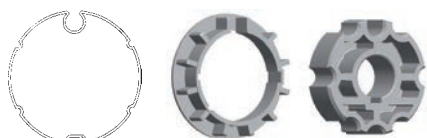
Ø85 x 1,5 mm Corona e ruota / Crown and wheel