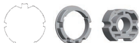
Ø80 x 1/1,2 mm Corona e ruota / Crown and wheel